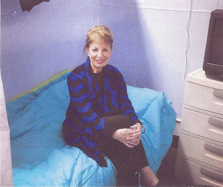
Congresswoman Speier has been an advocate of IVSN's homeless services since the agency was founded.