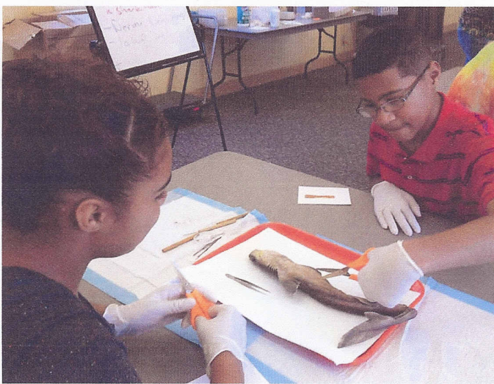
Children at IVSN shelters are exposed to STEM—science, technology, engineering, and math—through summer camp activities and field trips.