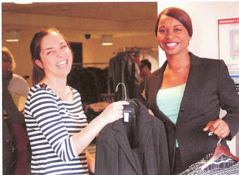
Volunteers are vital to helping IVSN clients prepare for career fairs and job interviews.

IVSN's upcoming Job Fair Prep Clinics will be held May 21 at Montgomery Street Inn (San Jose), June 3 at First Step for Families (San Mateo), and June 5 at Haven Family House (Menlo Park). To make a donation or volunteer, visit www.ivsn.org . ■