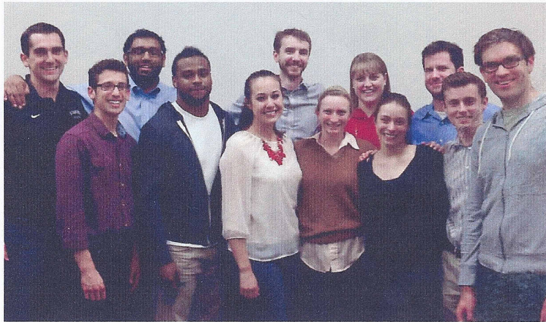
IVSN's NextGen Advisory Board brings together young professional leaders who are socially conscious and striving to make an impact.